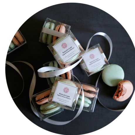
3. Favor box ($1ea)

STORAGE INSTRUCTIONS: 90 days in the freezer / Thaw 1 hour before serving