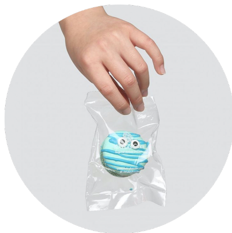
1. Individually wrapped